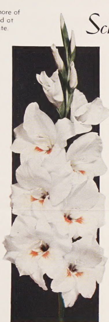
MARGARET BEATON $1.55 for 10 $13.00 per 100